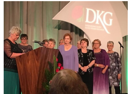
DELTA KAPPA GAMMA SOCIETY INTERNATIONAL CONVENTION 2018 AUSTIN, TEXAS