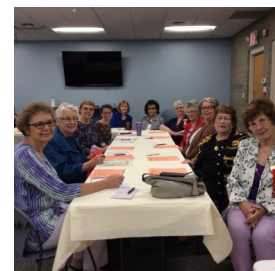
Many of our wonderful Upsilon members waiting for our May business meeting to begin.