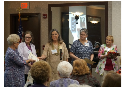
Chi, Upsilon, and Zeta recognized for adding 4 new members