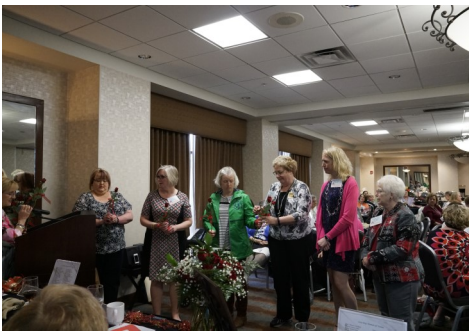
Rosebud Awards to those in attendance