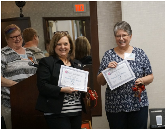
Annie Project Award: Zeta Chapter and Alpha Beta Chapter