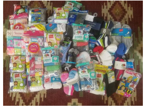
Members donated 104 pairs of girl's underwear, 30 pairs of boy's underwear, 51 pairs of girl's socks, and 57 pairs of boy's socks for the September service project for the children at Sixth District Elementary in Covington.