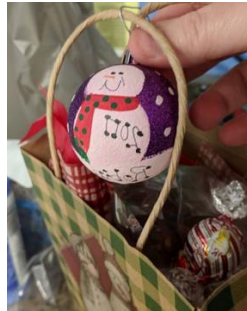
All our actively teaching members received surprises delivered to their schools at the beginning of the year and at Christmas.