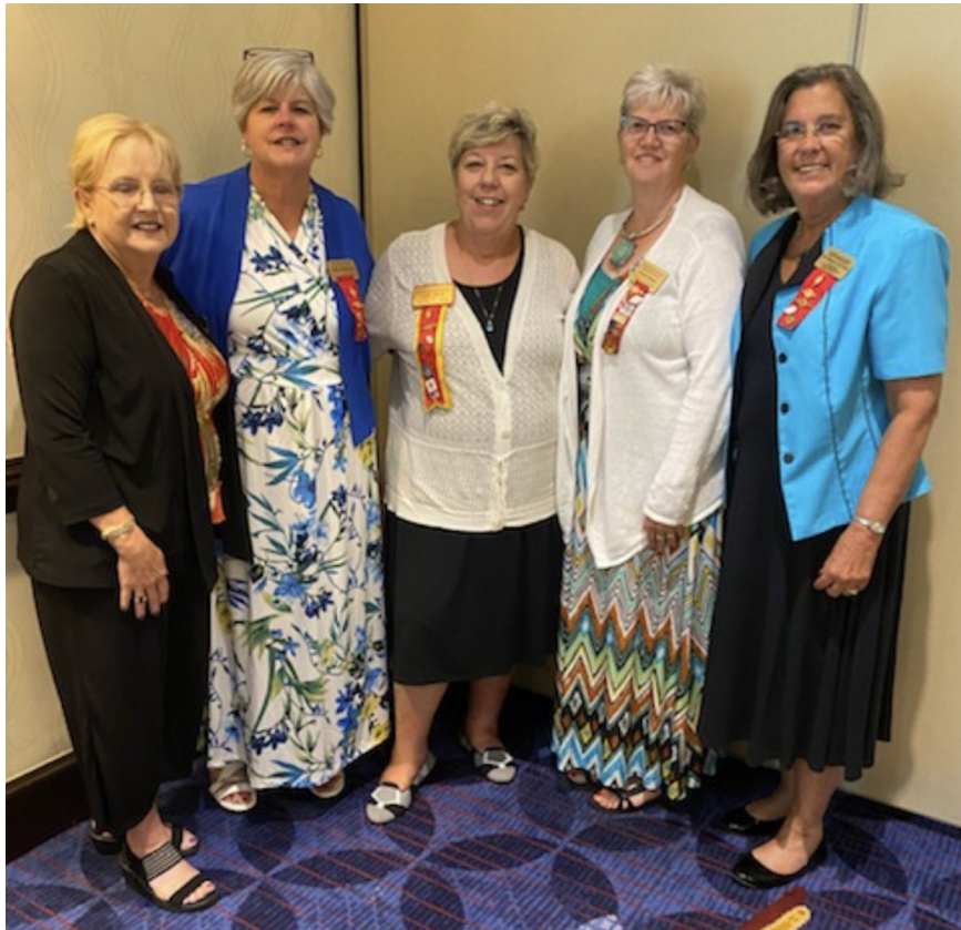
KSO Leaders at Atlanta Training Session

For membership keep in mind the acronym “APPS” – Advocacy, Personal growth, Professional growth, and Service projects that are relevant. Know that I, as well as the other KSO Officers, are available to assist and answer any questions or concerns you may have! Is membership in DKG a job or a joy? You decide!