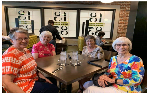
Zeta Sister Watch friends enjoying lunch and relaxing.