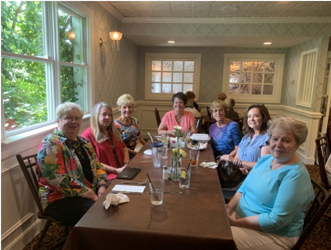
Zeta sisters enjoying lunch at the Greyhound Tavern, Ft. Mitchell, KY

Shown here are other activities Zeta sisters have enjoyed this summer: