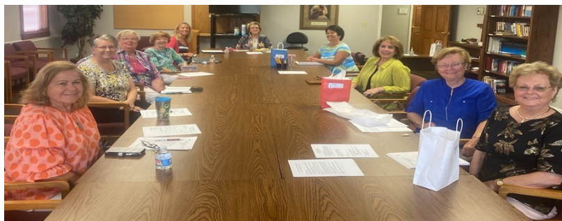
Zeta Executive Board and Committee Chairs meeting on August 6,2021

On August 6, our Executive Board and Committee Chairs met for our planning session for 2021-22, and we are excited to begin our 2021-22 year with lots of ideas for growth as we continue our theme to Know, Grow, Glow, Together . This includes continuing our Sister Watch Project where each sister is paired with another sister in a caring relationship, to keep watch over each other. Fall plans include attending the Fall Leadership Conference on September 10-11; attending our Chapter meeting on September 25 (moved from our regular date of September 18); growing our Chapter by inducting a new member at our September meeting; and introducing three potential new members at our November meeting. Fall also ushers in our Non-dues Revenue fundraising projects to support Grant-in-Aid (Scholarship); World Fellowship/Schools for Africa; and our Chapter outreach programs for Books, Bibs, and Beyond and the Lincoln Grant Scholar House.