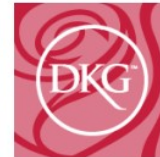
Conferences Coming Soon to DKG App