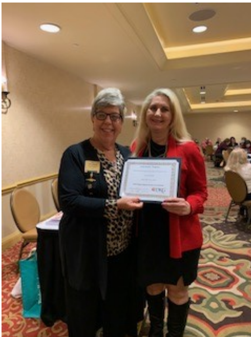
Nu Chapter “Rum Cakes for a Cause” Annie Award Program