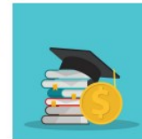
Scholarship Award Recipients List

J uly is fast approaching, which means the time to register for the 2023 International Conferences in Detroit, Phoenix, and Tampere is now! Each conference offers five days of education, excitement, and comradery. Locations in three gorgeous cities offer a conference for every individual flavor. See CONF p. 8