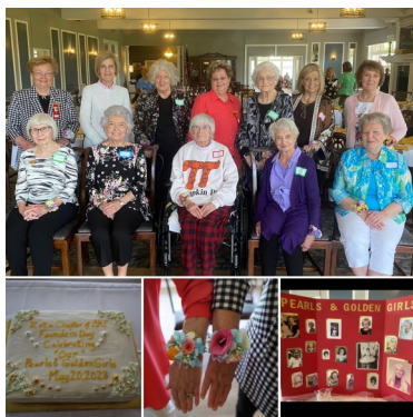
Image 1 - "Pearls & Golden Girls" celebration for Zeta sisters that have been members of DKG for 30-59 years.