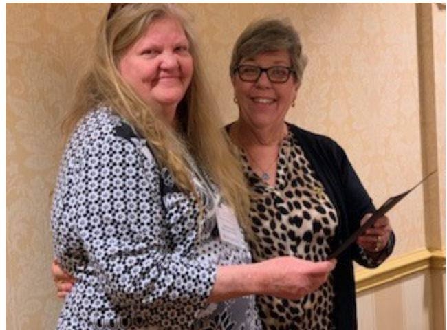
Beta Chapter Morning Joe and a Bagel to Go!! Annie Award Project