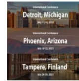
Latest Conference Updates and Details