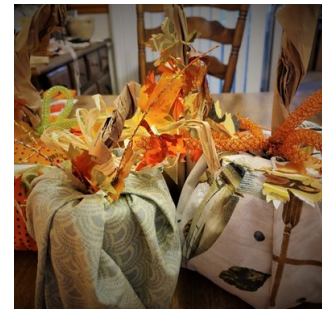
Psi Chapter craft activity using a variety of items to make pumpkins as shown in this picture.

Upsilon Chapter service project was a collection of baby items to be donated to Care Net Pregnancy Center.