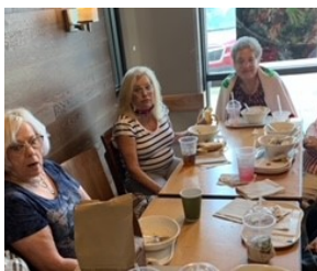
July 3 social opportunities for Xi Chapter : the Union Restaurant & Gameyard., Panera Bread on Hurstbourne Lane in Louisville, and finally, later in July, ten of us gathered at Captain’s Quarters.