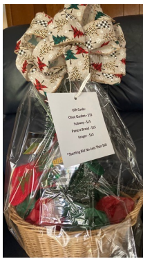
Alpha Beta Basket Auction