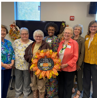
Fall wreaths were bid on during the Alpha Alpha Silent auction .